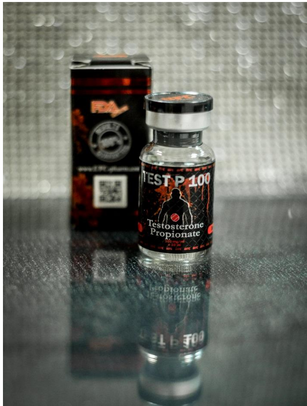
Pic. 1 – Sample appearance.