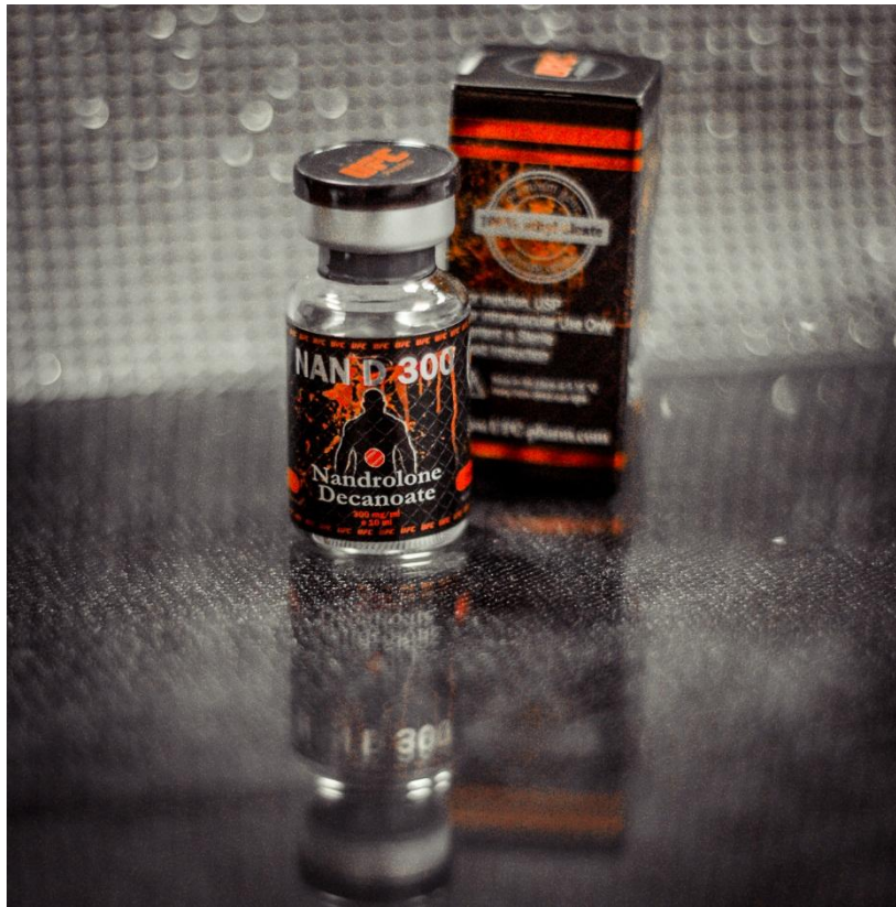
Pic. 1 – Sample appearance.